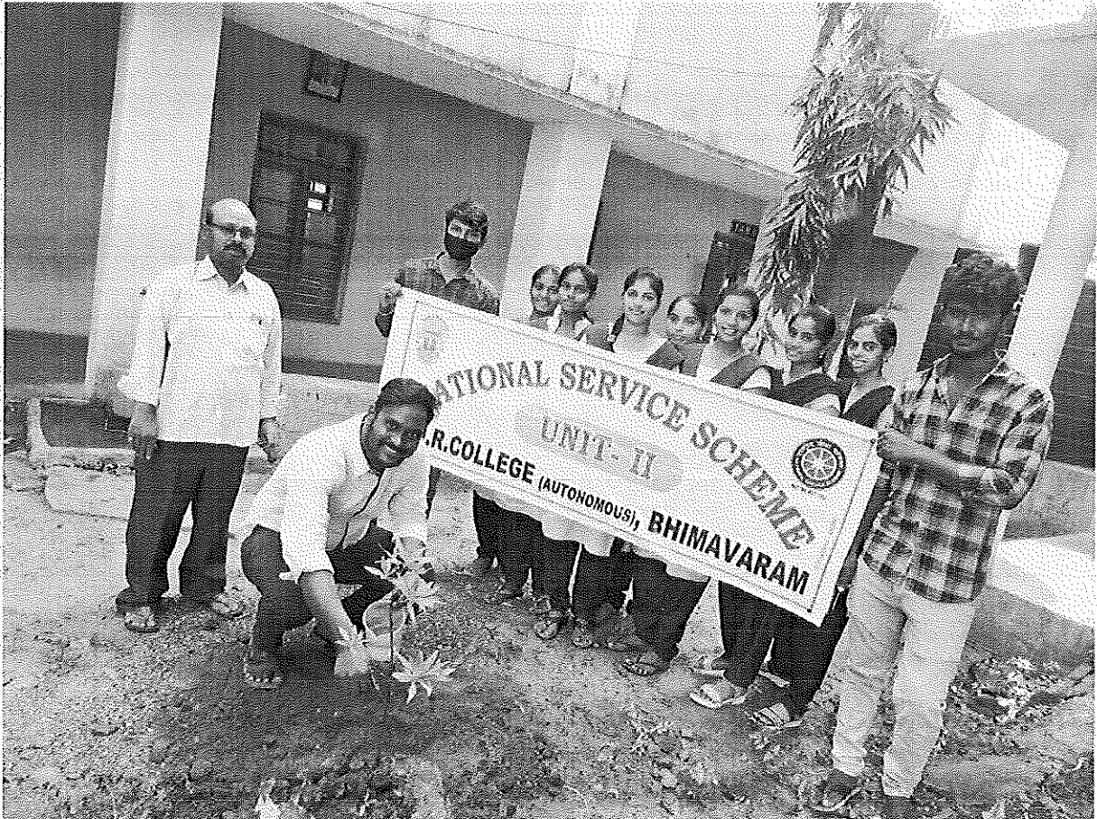
TREE PLANTATION PROGRAMME

Academic year 2022-23 National Service Scheme (NSS Unit) PHOTOS / PRESS CLIPPINGS