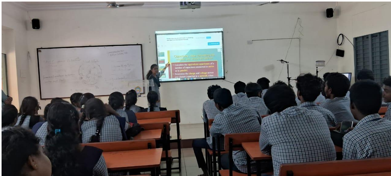
P. Radhika , 782 ( Topic : Parallel Plate capacitor )